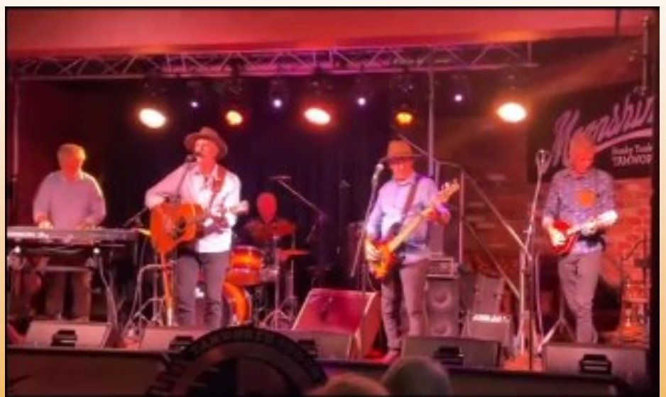
A perfect finish to a fantastic Awards night. Two Tone Pony won a few more hearts rocking Moonshiners to an appreciative crowd.